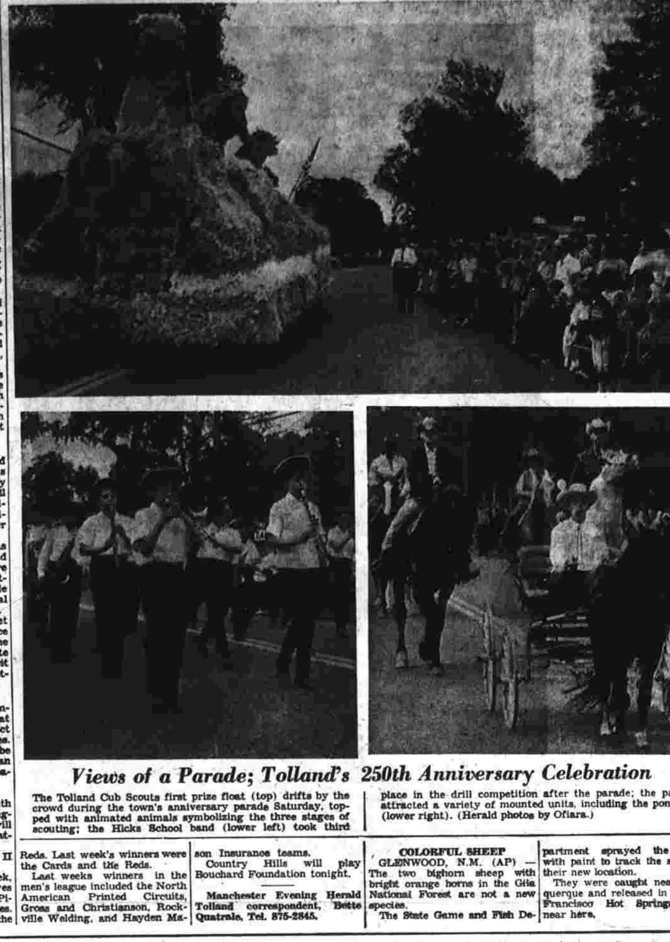
Views of a Parade; Tolland's 250th Anniversary Celebration