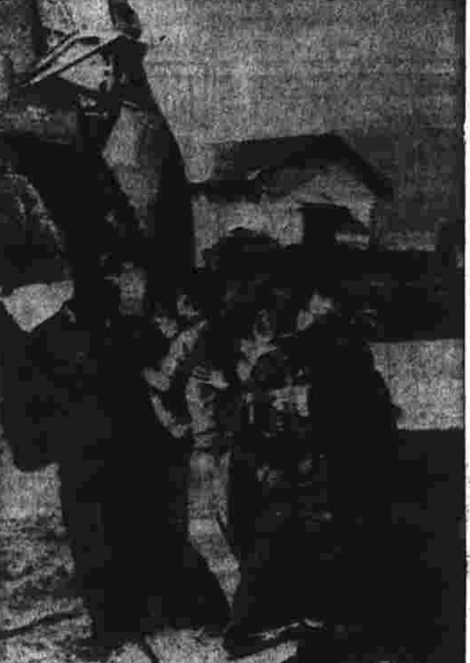
Residents of Ba Gia claw and fight to get aboard U.S. helicopter—one of two able to land at the area, under heavy mortar and small arms fire from the Viet Cong.